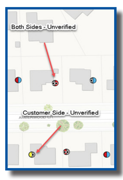
ESRI ArcGIS Lead Service Line Inventory sample map

For more information, contact Jen Mates at jennifer.s.mates@des. nh.gov or (603) 559-0028. ♦